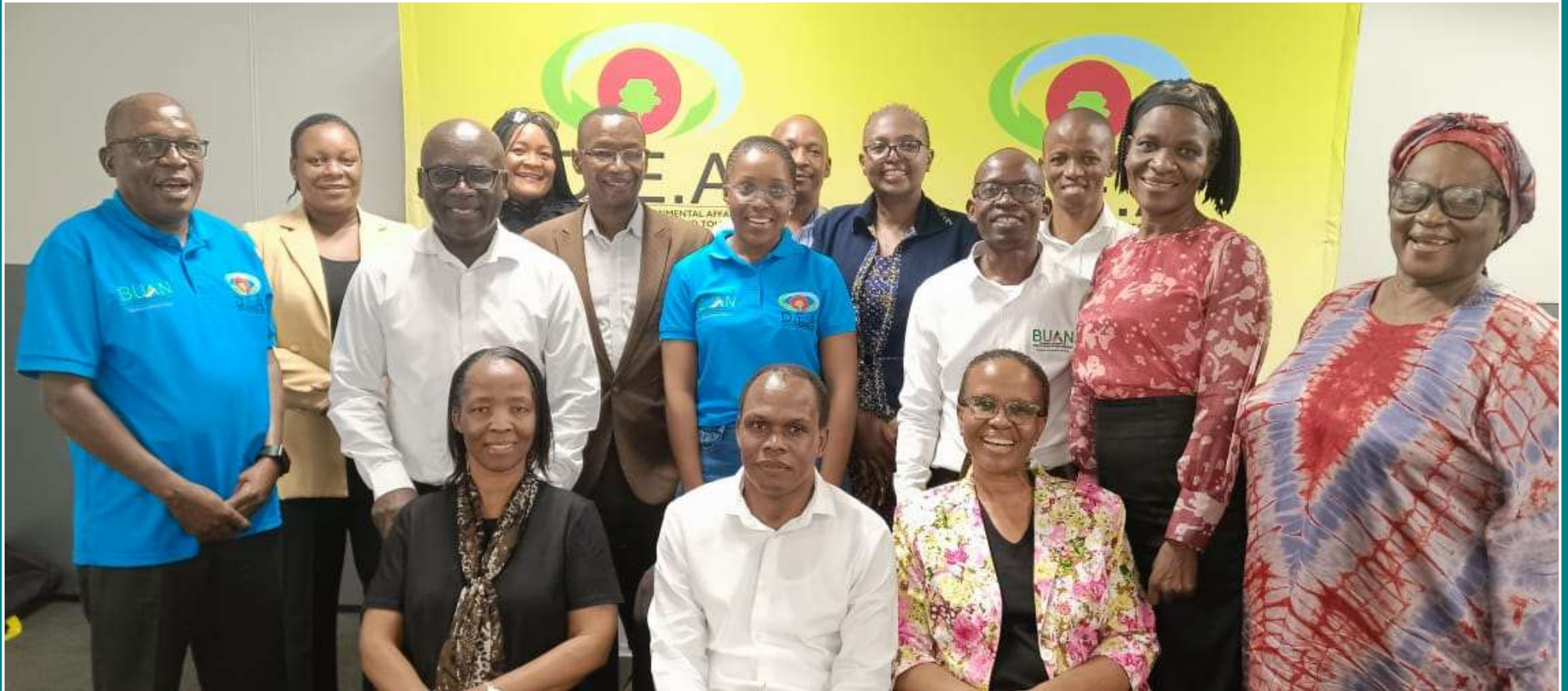
TRG meeting where annotated chapter outline (zero draft) and data management plan were considered.